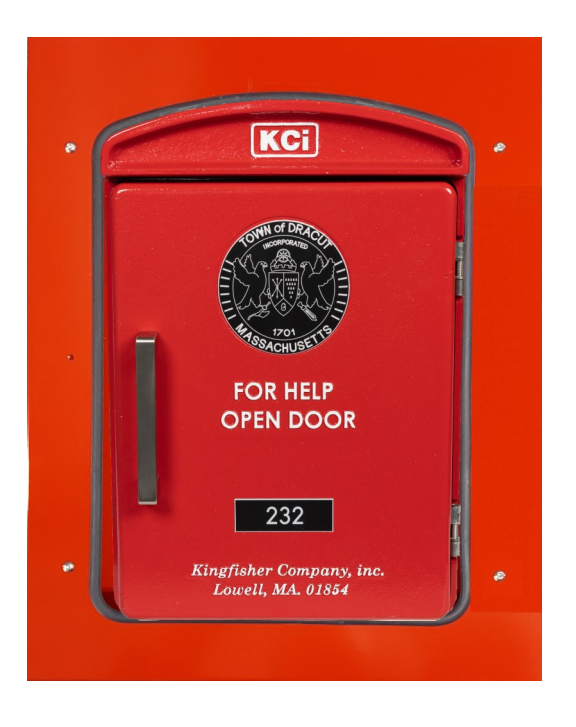
99911-R-R-PN-1 With 91724 (FM-C) Callbox with Exterior Wall mounted Semi-Flush Trim Kit